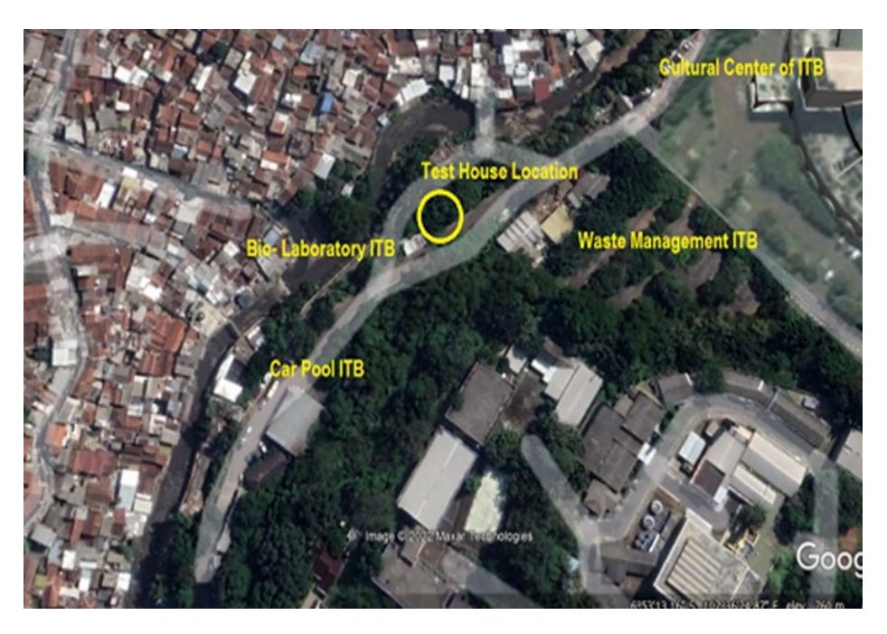
Location map of the planned construction site on the premises of Bandung Institute of Technology