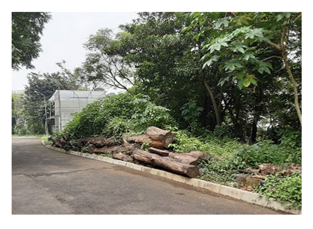
Planned construction site on the premises of Bandung Institute of Technology