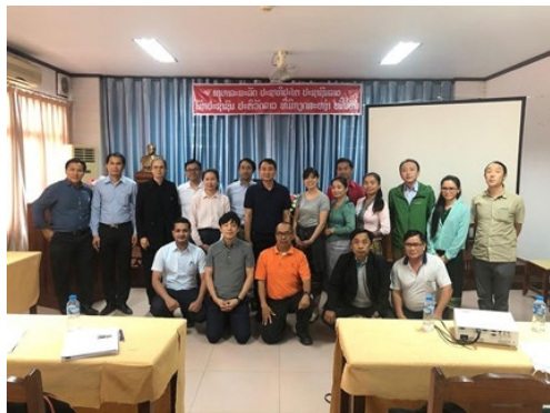
Group shot at PPP seminar