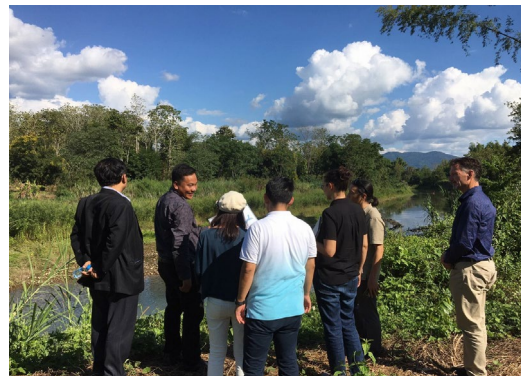
Planned development site