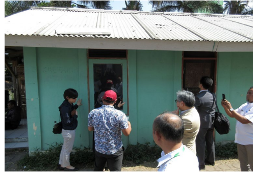
Low-cost house made of bamboo by ITB