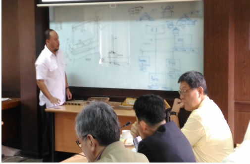
Technical Meeting at PUSKIM