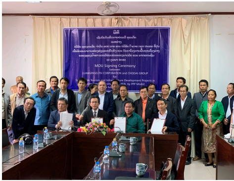
Report session at Luang Namtha

Luang Namtha Province needs to lead future development based on its unique characteristics, taking into account available natural resources, and cultural diversity, etc. Specific policies are needed in order to promote the development. In addition, the project has value beyond just tourism development and will enhance other areas, including easy access to education for ethnic minorities. This is a great opportunity to improve various sectors at all the level. Under the principles of sustainable development, a clear vision, its related strategy, and its action plan are needed to collaborate between LCC and the province. Luang Namtha is currently at a critical crossroads for the future development.