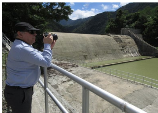
Small hydropower facility