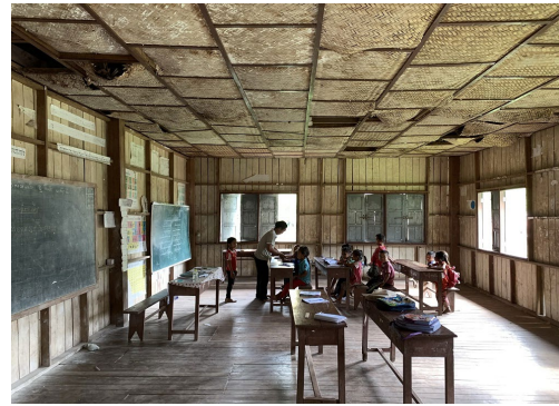
Elementary school for the ethnic minority