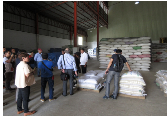
Rice milling facility