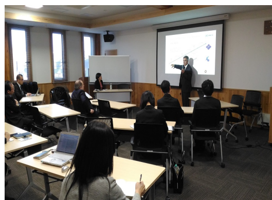
Lecture for SDGs at Shiwa town hall