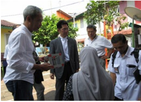
Inspection tour for RISHA`s house