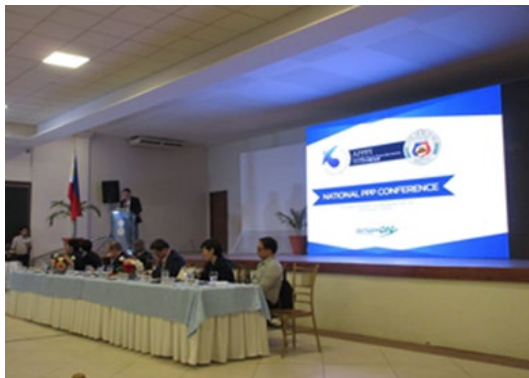
Opening at National PPP Conference

As a part of this National PPP conference, the field trip to visit several sites for RDAP was held. We visited several pilot sites, such as a small hydropower station, an eel farm (with an eel processing facility), a water supply facility, and a rice milling facility, which are being implemented on the outskirts of Butuan City. Then we exchanged the opinions with the mayor and the city officials.