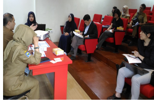
Dialogue meeting at Bandung PU