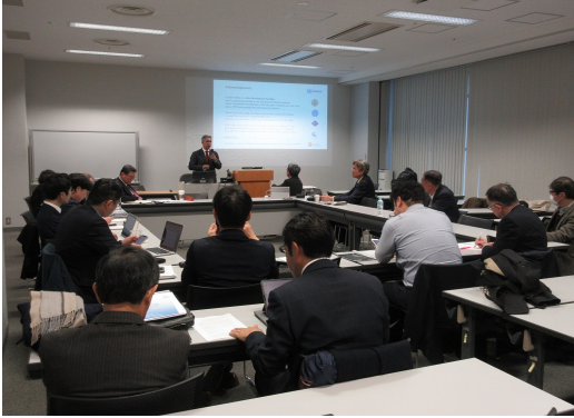
3rd APPPI Open seminar

People First PPP Program and SDGs promoted by the United Nations. Through several inspection tours for RDAP projects supported by APPPI, we exchanged views on evaluation of the projects in terms of "Sustainable Regional Development".