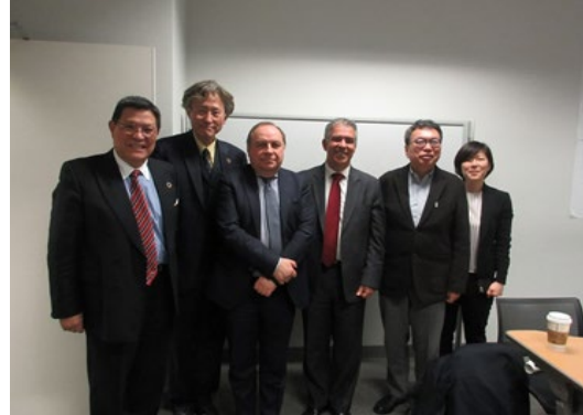
Group shot with guest speakers from UNECE