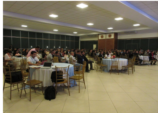
Over 120 attendees at the conference