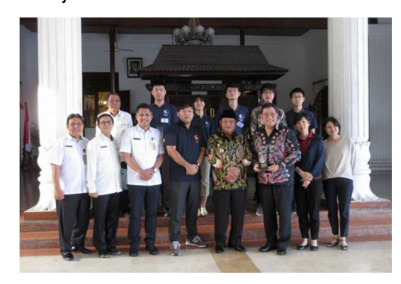
<The 7th Field Visit: November 24th to 28th, 2018>

We visited Bandar Lampung Water Supply PPP Project, which entered the construction phase from October 2018. This project is under a mid-term development plan 2015-2019, which aims to supply 100% of water to the country. By implementing this project, Bandar Lampung city estimates to increase the water supply rate from 20.51% to 50.04%. The project was initiated in 2009-2010 when PDAM (city owned local water supply company) requested to the Ministry of Finance (MOF) to consider a PPP project. Although the 1st bidding, conducted in 2015 did not succeed, due to the high water price presented by the private sector, the SPC was selected among 4 competitors in the 2nd bidding in 2017. According to the interviews with the relevant stakeholders, the lessons learned from planning this project are; 1) strong commitment is required from each stakeholder, especially from the local government, 2) it requires at least a couple of years to develop proper legal systems for a new project, and 3) the government needs to offer support or take certain risks to implement a water PPP project to encourage