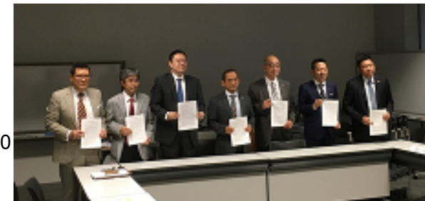
Signed MOUs to promote cooperation

Excellence on PPPs in Local Governments in October 2015. Under